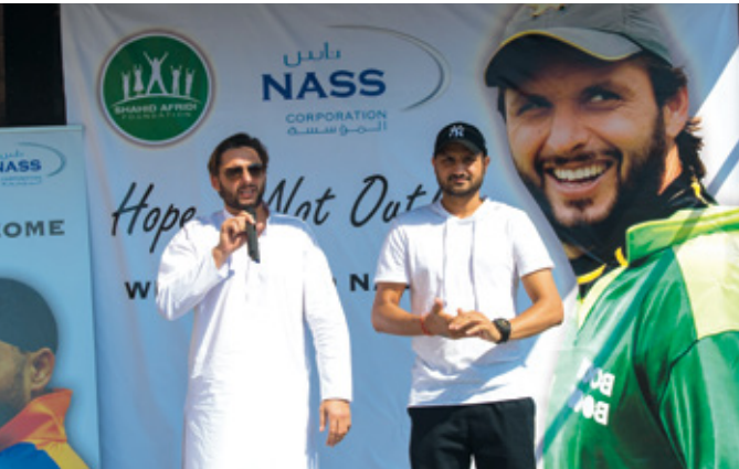
Mr. Afridi, Left and Mr. Singh sharing words of love and peace with the crowd.

Both legendary cricketers have visited one of NASS's labour camps on 27th October, 2017 as part of Mr. Shahid's world tour, which aims to spread awareness about his charity foundation; the Shahid Afridi Foundation, an NGO that helps the underprivileged sections of the society in Pakistan.