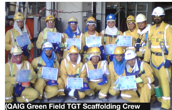
(QAIG Green Field TGT Scaffolding Crew