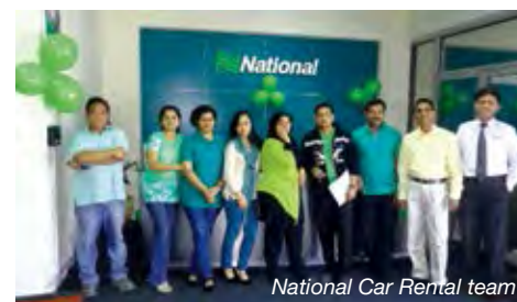
National Car Rental team