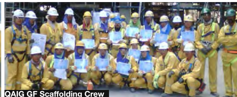
QAIG GF Scaffolding Crew