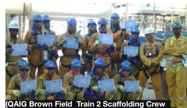
(QAIG Brown Field Train 2 Scaffolding Crew