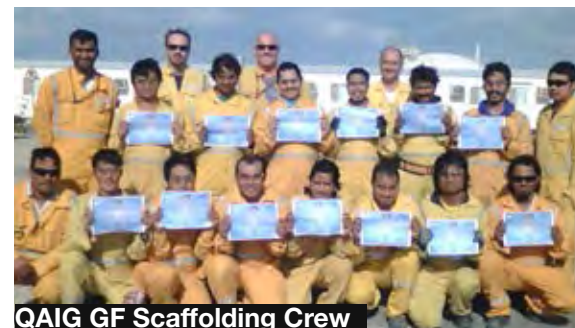
QAIG GF Scaffolding Crew