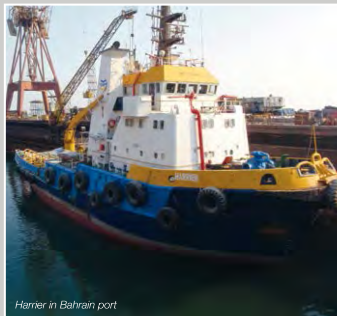
Harrier in Bahrain port

Supported by a team of highly qualified and dedicated marine professionals, the Company operates to the highest standards of marine safety and environmental pollution control.