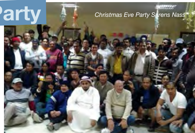
Christmas Eve Party Sarens Nass

Celebrations were held across Nass celebrating Christmas Eve the last day of 2013. As part of the celebrations, all the employees were highly appreciated for their distinguished roles and achievements.