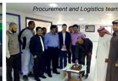
Procurement and Logistics team