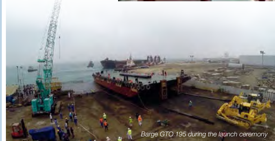
Barge GTO 195 during the launch ceremony